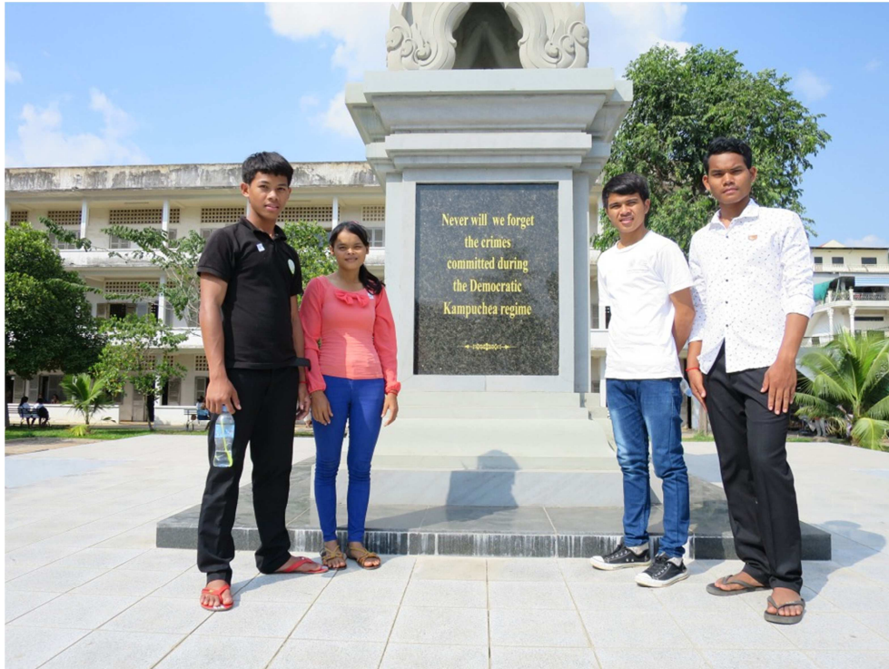
Visiting museums relating to a period of the most recent bloody history, the Khmer Rouge.