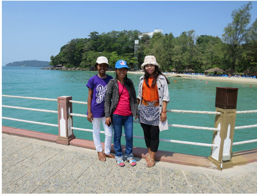
Time to visit the sea, take one of our "older girls", who at 85 years had not seen the sea, and also time for caves with stories of dragons.