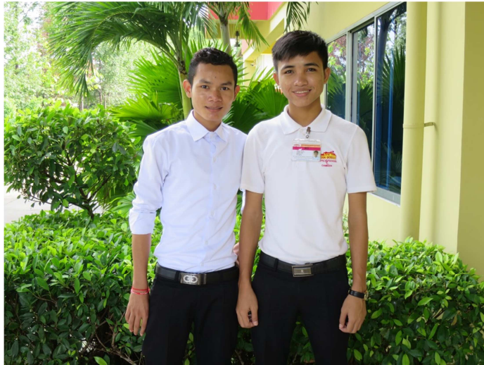
S and R at the Hotel School Don Bosco , where they are studying as Receptionists and ... a surprise visitor who see them frequently to further strengthen their ties.